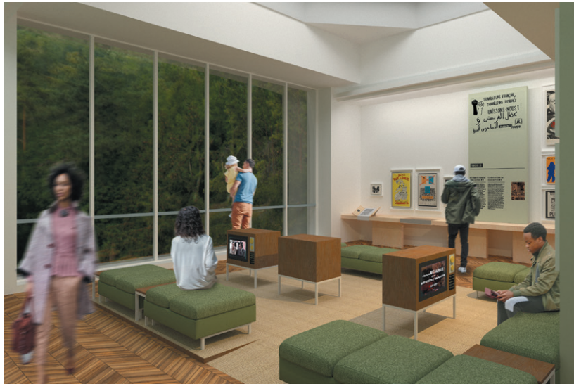
View of the future 1983 focus and the Mosaic Room in the new permanent exhibition.