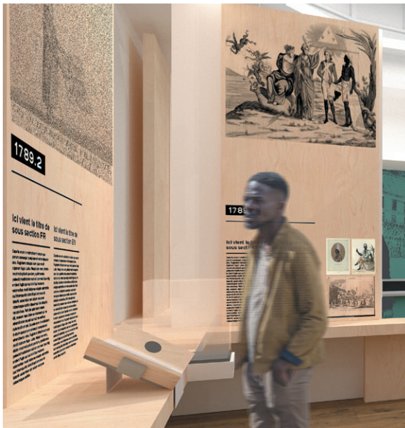
View of the future 1789 focus in the new permanent exhibition.