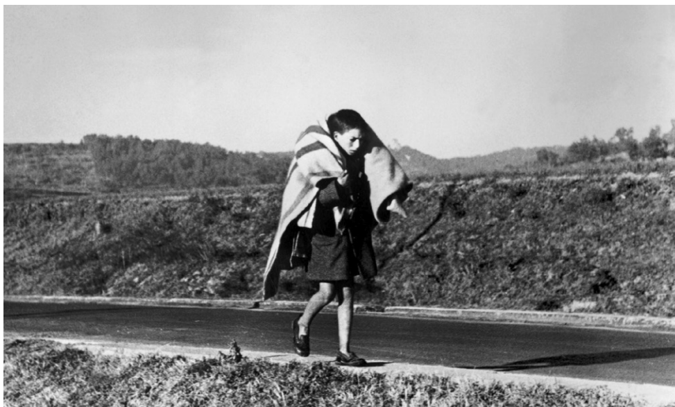
Robert Capa, On the road from Barcelona to the French border , January 1939 © MNHI, Robert Capa/Magnum Photos.

Each section will highlight major events from the period and include thematic focus points, combining political, cultural and social history. The Museum's collections (contemporary art, photographs, archive documents and everyday objects from the past) will be showcased and complemented by deposits from other public institutions. The exhibition will also be enriched with archive exhibits, audiovisual works and digital devices.