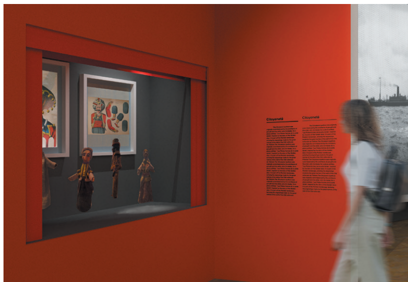
View of the future 1889 and 1917 focus sections in the new permanent exhibition.