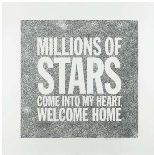
John Giorno, Millions of stars come into my heart, welcome home, 2005