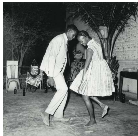
Malick Sidibé, Christmas Eve , 1965

From 18 October 2016 to 8 January 2017, the agnès b. Collection will be featured at the Musée National de l'Histoire de l'Immigration, interacting in a wholly original way with contemporary works in the museum. This is the first time that agnès b. has chosen to display a selection of works in Paris from the extraordinary collection of contemporary art which she has built up over the years, including photographs, installations and paintings.