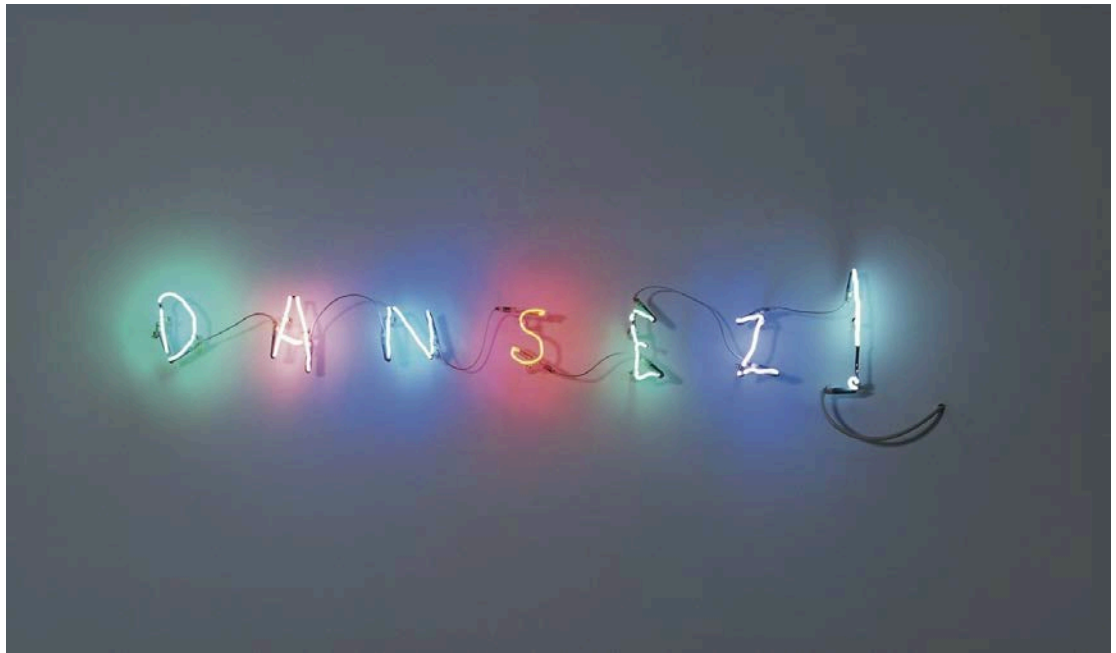
Claude Lévêque, Untitled (Dansez!) , 1995.

« Collectors are unique because they can give completely free rein to their passion. The works which they assemble express their relationship with the world and their own identity. agnès b. has been collecting for many years and enjoys the special status of being a prominent figure on the French artistic scene in her own right.