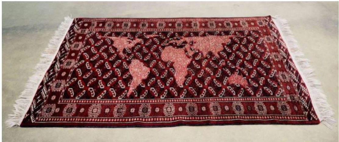
Mona Hatoum, Bukhara (red and white) 2008/Wool rug (143 x 225 cm). Musée National de l'Histoire de l'Immigration collection. Photo: Martin Argyroglo, Courtesy of Galerie Chantal Crousel, Paris © ADAGP Paris 2016.